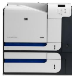
HP LaserJet Enterprise 500 color M551 printer series