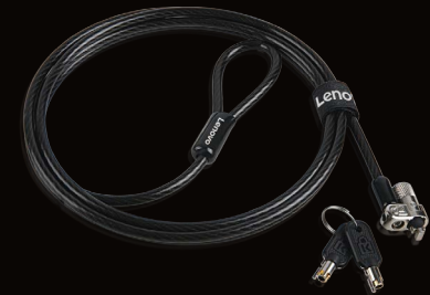
Kensington Microsaver ▶ 2.0 Cable Lock