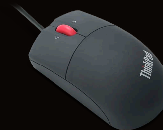
◀ ThinkPad USB Laser Mouse