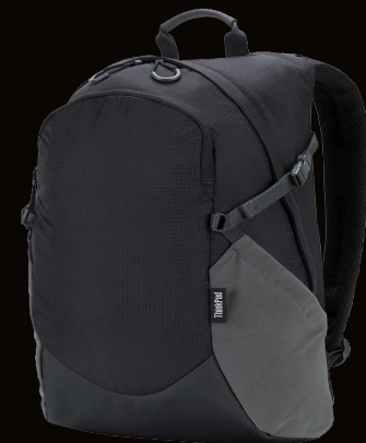
ThinkPad Active ▶ Backpack