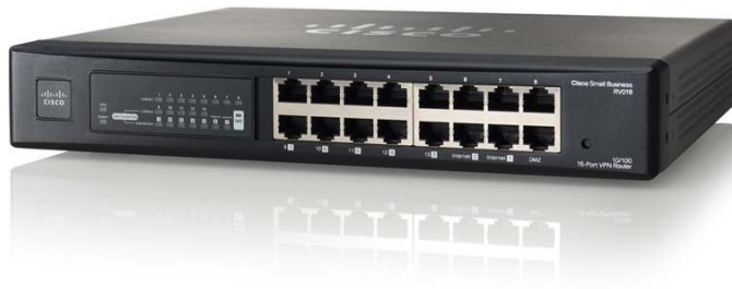
Figure 1. Cisco RV016 Multi-WAN VPN Router

To further safeguard your network and data, the Cisco RV016 includes business-class security features and optional cloud-based web filtering. Configuration is a snap, using an intuitive, browser-based device manager and setup wizards.