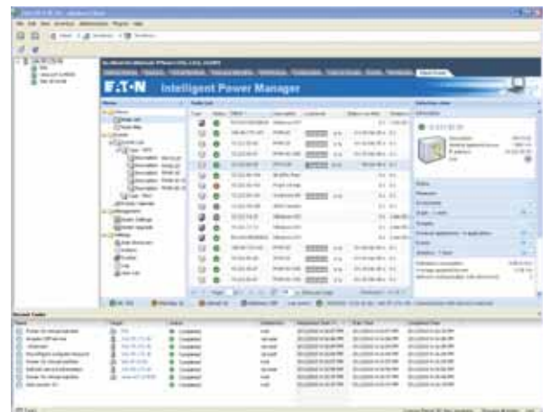
Remote Monitoring - IPM