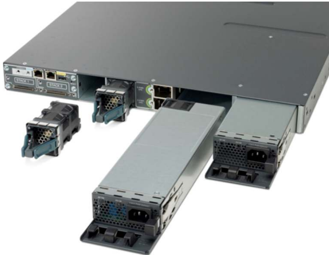
Figure 5. Dual Redundant Power Supplies

Table 6 shows the different power supplies available in these switches and available PoE power.