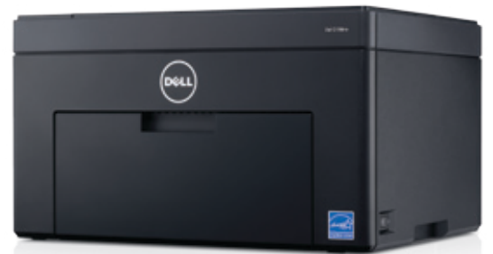
Dell™ C1760nw Color Printer

Designed to provide for the printing needs of your home office or small and medium businesses, the ultra compact Dell C1760nw Color Printer is easy to use and offers brilliant color prints with reliable performance. With built-in Ethernet and WiFi 1 connectivity, you can easily share this printer within a small network. Plus, it features energy efficient LED printing technology and fast print speeds that help enhance office efficiency.