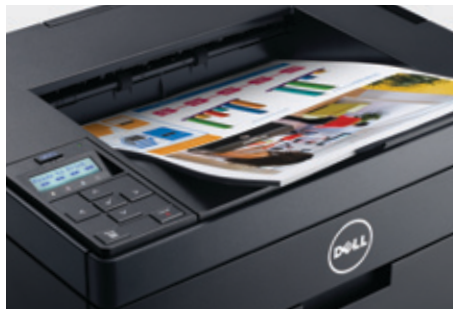
Enjoy fast print speeds of up to 15 pages per minute (ppm) black and 12ppm color (A4/Letter) 7 .