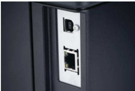
Networking versatility with built-in WiFi, Ethernet and USB 2.0 connectivity.