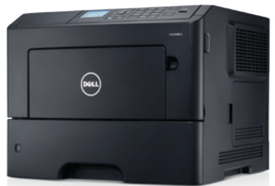
Dell™ B3460dn Mono Laser Printer

Gain efficiency and outstanding performance along with a low total cost of ownership with the Dell B3460dn Mono Laser Printer. Combining reliability, speed, long-term value with advanced security and productivity features, this workhorse printer also offers the flexibility to expand along with your business.