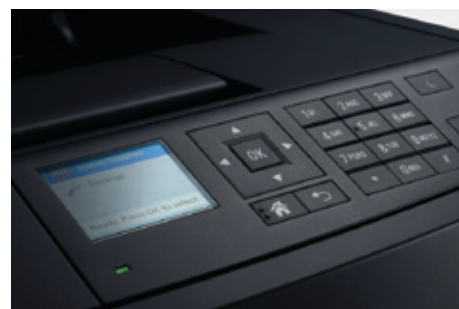
Ease of operation with intuitive 2.4 inch LCD with numeric pad.