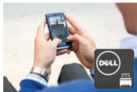
Print directly from Android™ mobile devices using the Dell Mobile Print app 3 .