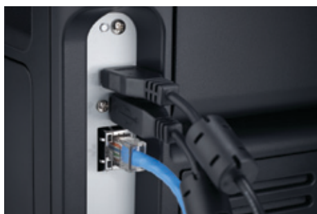
Fast data transmission with Gigabit Ethernet 10/100/1000.