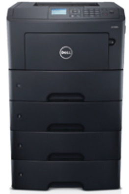
Extended B3460dn configuration with three 550-sheet optional trays