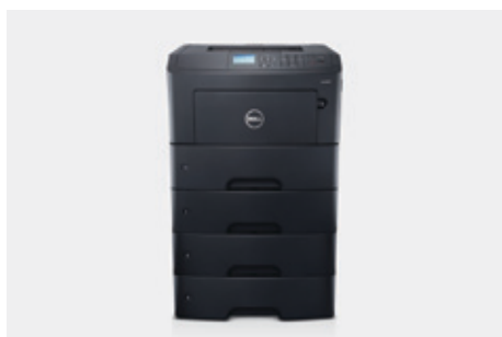
Increase the printing capacity to 2,300-sheets by adding three optional 550-sheet trays (sold separately).