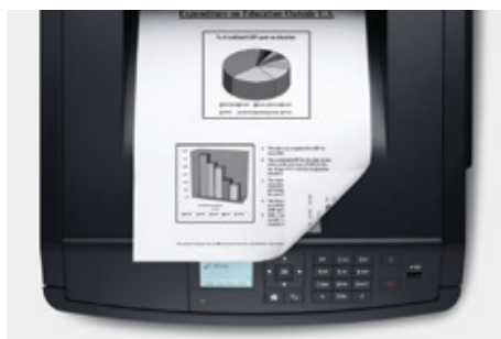
Increase efficiency with fast print speeds of up to 50ppm (letter) / 47ppm (A4) 1 and automatic two-sided printing.