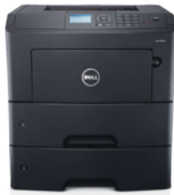
Extended B3460dn configuration with one 550-sheet optional tray