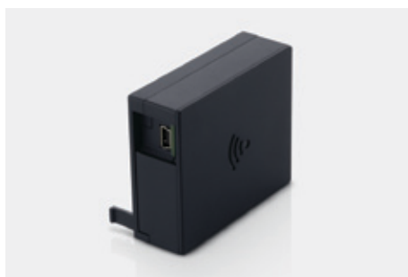
Easily connect to a wireless network with the optional External Wireless Adaptor (sold separately).