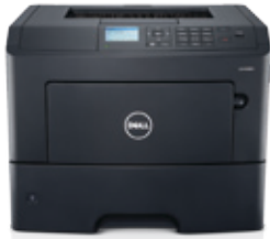
Standard B3460dn configuration